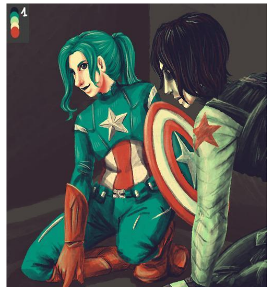
Art by Parker Goodreau .